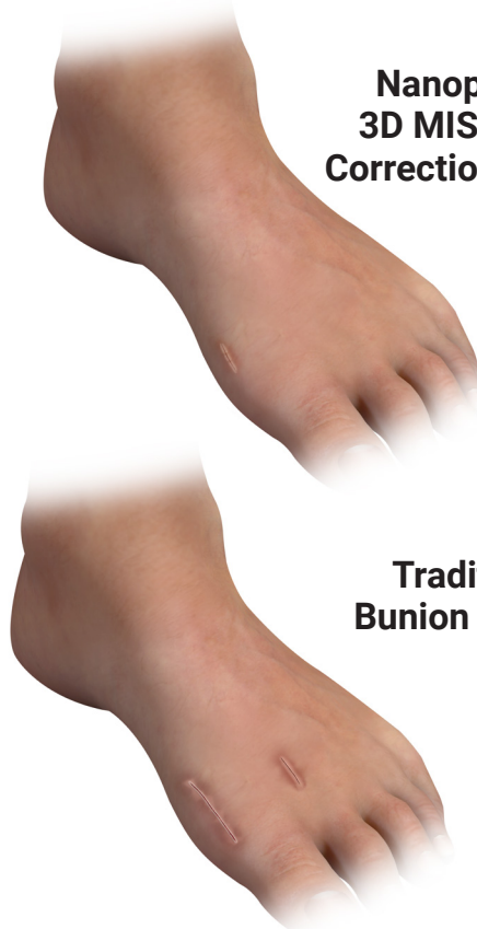
Nanoplasty™ 3D MIS Bunion Correction Surgery

MIS bunion surgery allows for smaller scars . 6